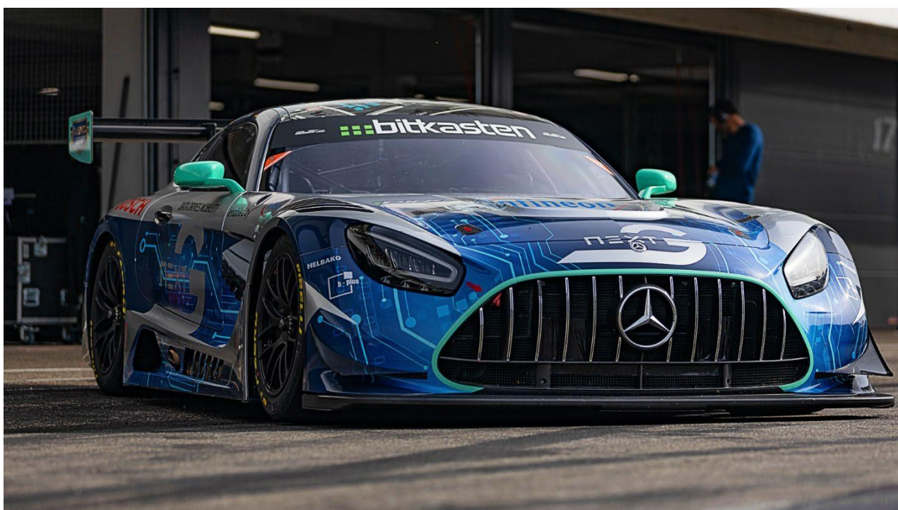
Arnold NextG is teaming up with Schnitzalm-Racing to field two Mercedes-AMG GT3s in the GTC Race and ADAC GT Masters.